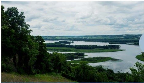
Chestnut Mountain Resort

Casper Bluffs - If you did the trail to the right at Horseshoe Mound, you'll deserve a relatively flat hike. If you're at the kiosk, take the trail to the left to get to the Thunderbird Effigy, the only one in the state. It's a short walk and you'll know you're there when you see a sign with information about the effigy mound. If you take the trail to the right, you'll get some