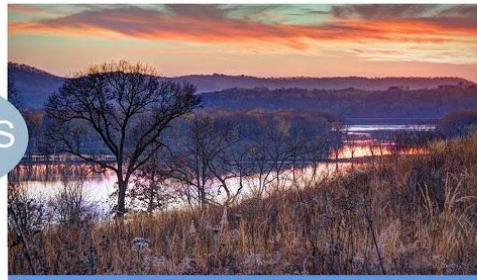
Casper Bluff Land & Water Preserve

Horseshoe Mound - When you are at the information kiosk, you have two options. Take the very easy and gently sloping trail to the left or go to the right where the trail descends approximately 500 feet to the valley below - just remember, you have to climb back up!