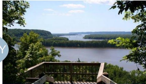
Mississippi Palisades State Park

The Mines of Spain State Recreation Area - a 20 minute drive from Aldrich Guest House in Dubuque, IA. The park features picnic areas, 15 miles of walking/hiking trails and 4 miles of ski trails. Check out the Horseshoe Trail for great views of the Mississippi River.