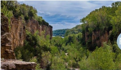
Mines of Spain

Winston Tunnel - Kind of a well-kept secret! There's no maps of this area but the trails are pretty logical. The beginning is pretty hilly but once you get to the old railroad bed, which is all grown over now but you'll know it when you're there, it flattens out for the rest of the trip to the tunnel.